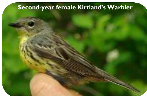
Second-year female Kirtland's Warbler

The spring 2015 data are still being compiled for our satellite stations but we can look at the data from our main banding station, Navarre Marsh. Our banding totals at Navarre Marsh this spring were 8,304 individuals, which is very close to the average number of birds banded each spring (7,905 individuals). We average more than 1,000 recaptures in a spring season, but this year we only had about 700 recaptures.