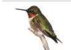
Ruby-throated Hummingbird = 3.2 grams