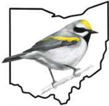
Ohio Young Birders Club FOUNDED IN 2006 BY BLACK SWAMP BIRD OBSERVATORY