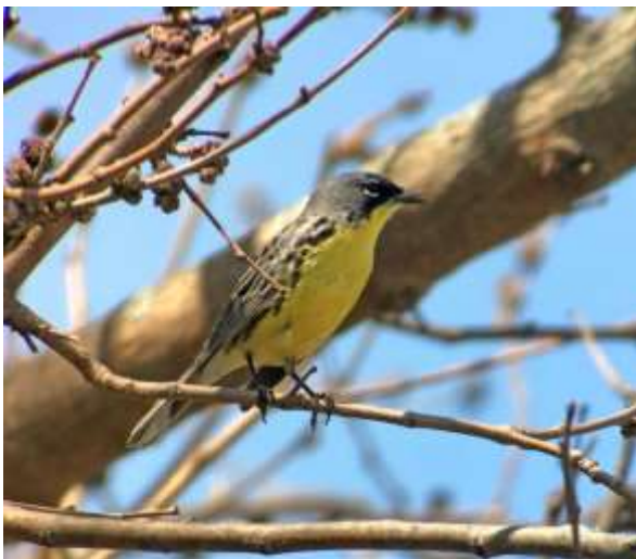
Kirtland's Warbler