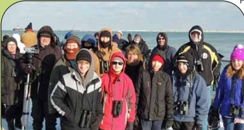
Young birders in the newly formed OYBC NE Chapter enjoying a cold but sunny day birding along Lake Erie in January 2014.

The support from our BSBO members make these opportunities possible for our young birders.