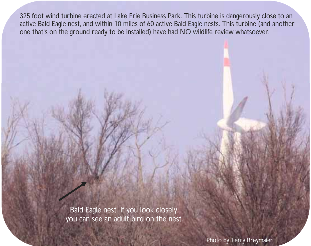
Bald Eagle nest. If you look closely, you can see an adult bird on the nest.

325 foot wind turbine erected at Lake Erie Business Park. This turbine is dangerously close to an active Bald Eagle nest, and within 10 miles of 60 active Bald Eagle nests. This turbine (and another one that's on the ground ready to be installed) have had NO wildlife review whatsoever.