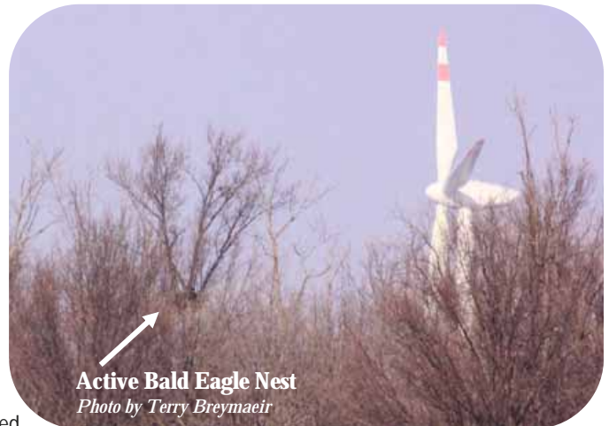
Active Bald Eagle Nest

The letter says further that if this poorly sited facility is being built in the absence of any EA, any permitting process, or any consultation with state or federal wildlife authorities, then it clearly represents another failure of the current voluntary permitting guidelines to protect our public trust resources. Whether on public or private land, our native birds and bats are not owned by the for-profit wind industry, but are owned by the American people and held in trust for current and future generations.