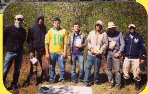
Above: Students at the Ramon Corona elementary school in San Blas, Nayarit. They are learning to identify birds in their community.