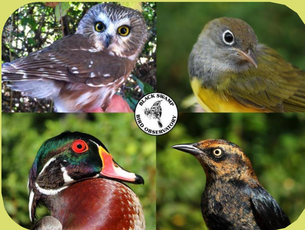
2015 Fall Banding Highlights. More on page 10.